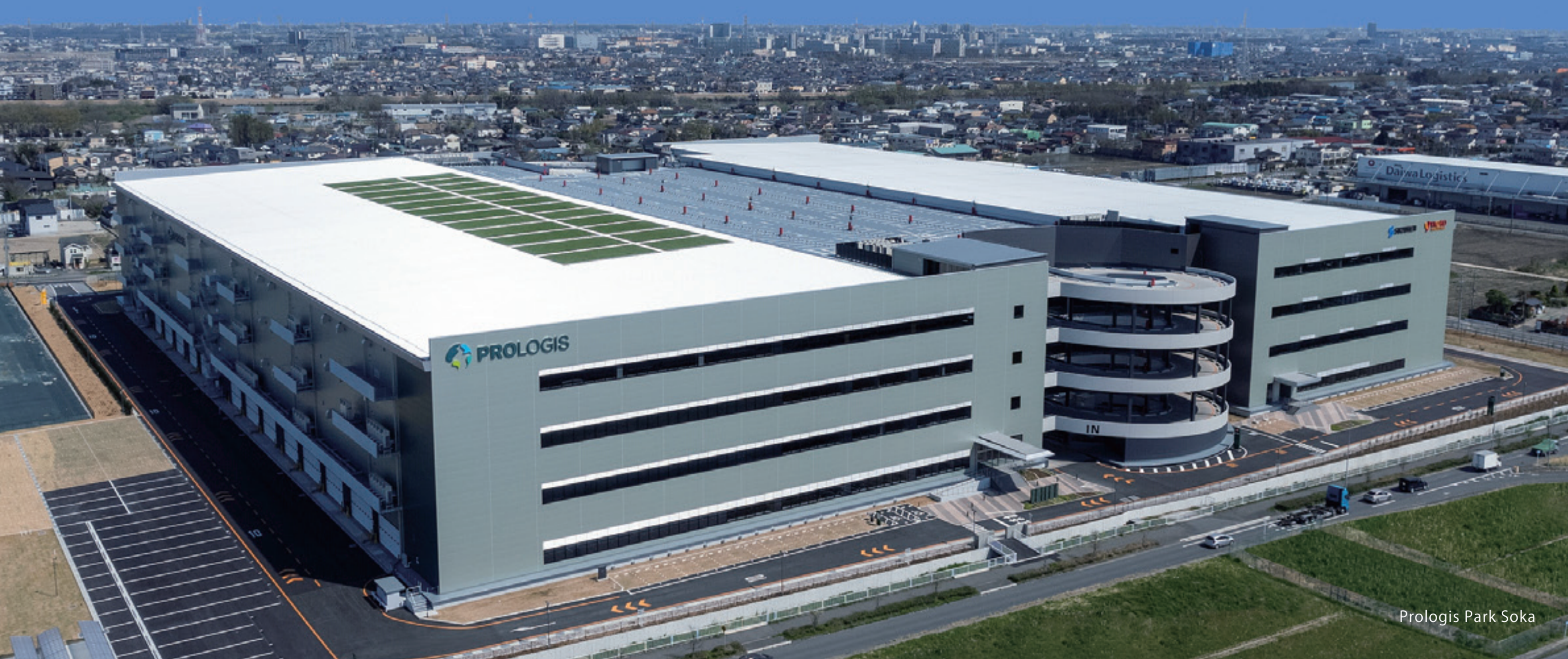
Prologis Park Soka